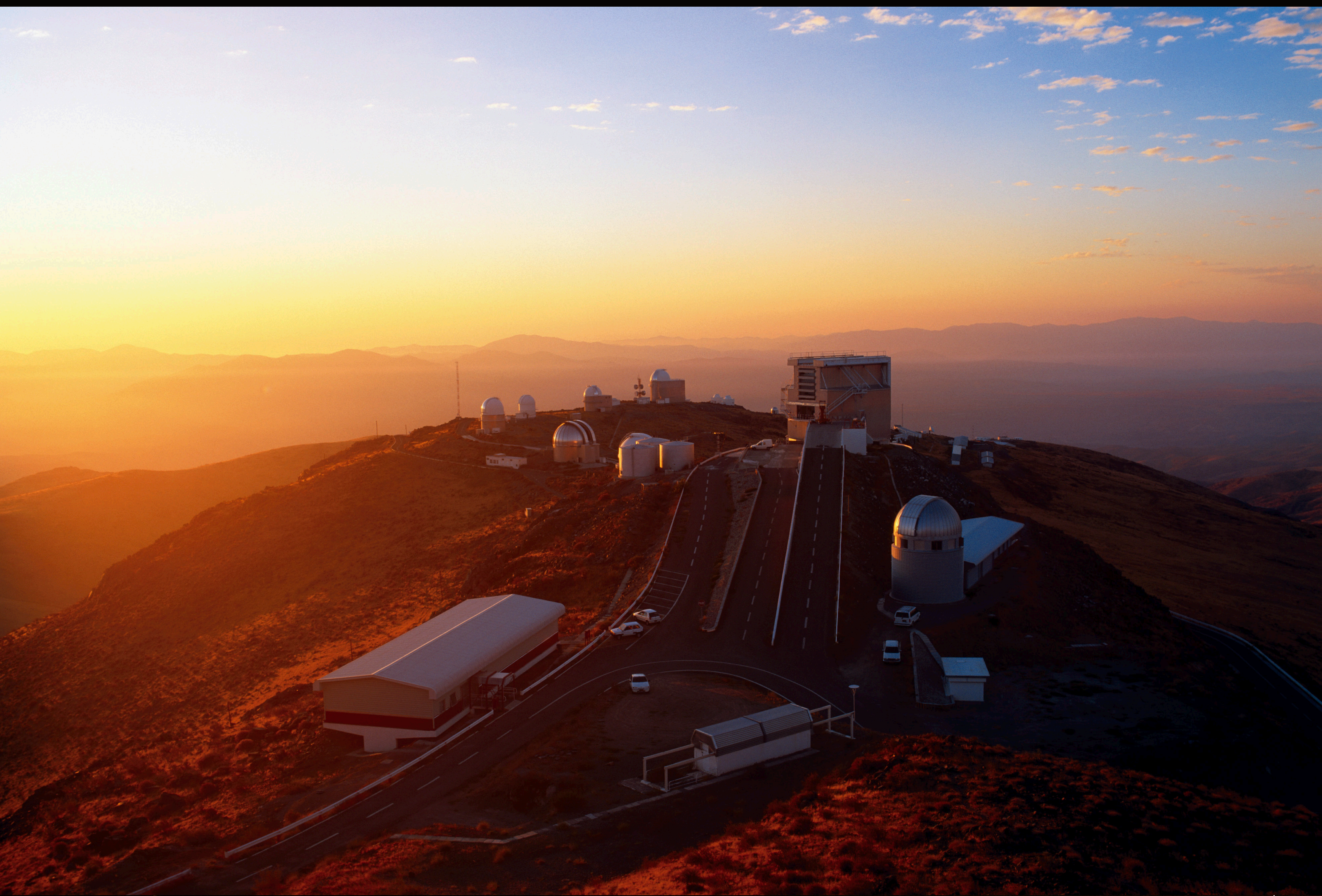
The La Silla Observatory.

On the 5000-metre-high Chajnantor plateau, together with global partners, ESO is operating the Atacama Large Millimeter/submillimeter Array (ALMA), a revolutionary astronomical telescope comprising an array of 66 giant 12-metre and 7-metre diameter antennas, which observes at millimetre and submillimetre wavelengths. On the same plateau, in another international partnership, ESO also operates the Atacama Pathfinder Experiment (APEX) telescope.