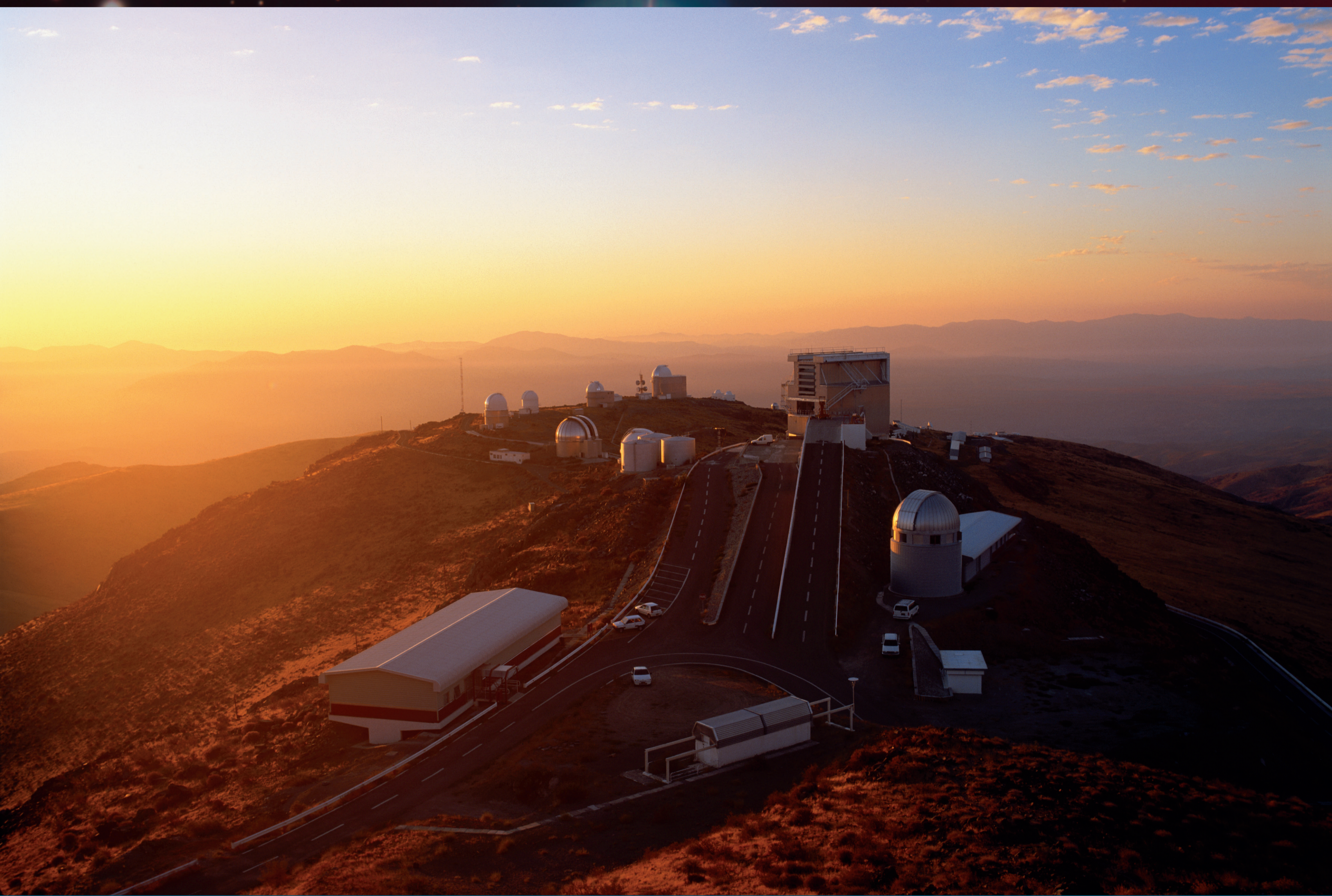
The La Silla Observatory.