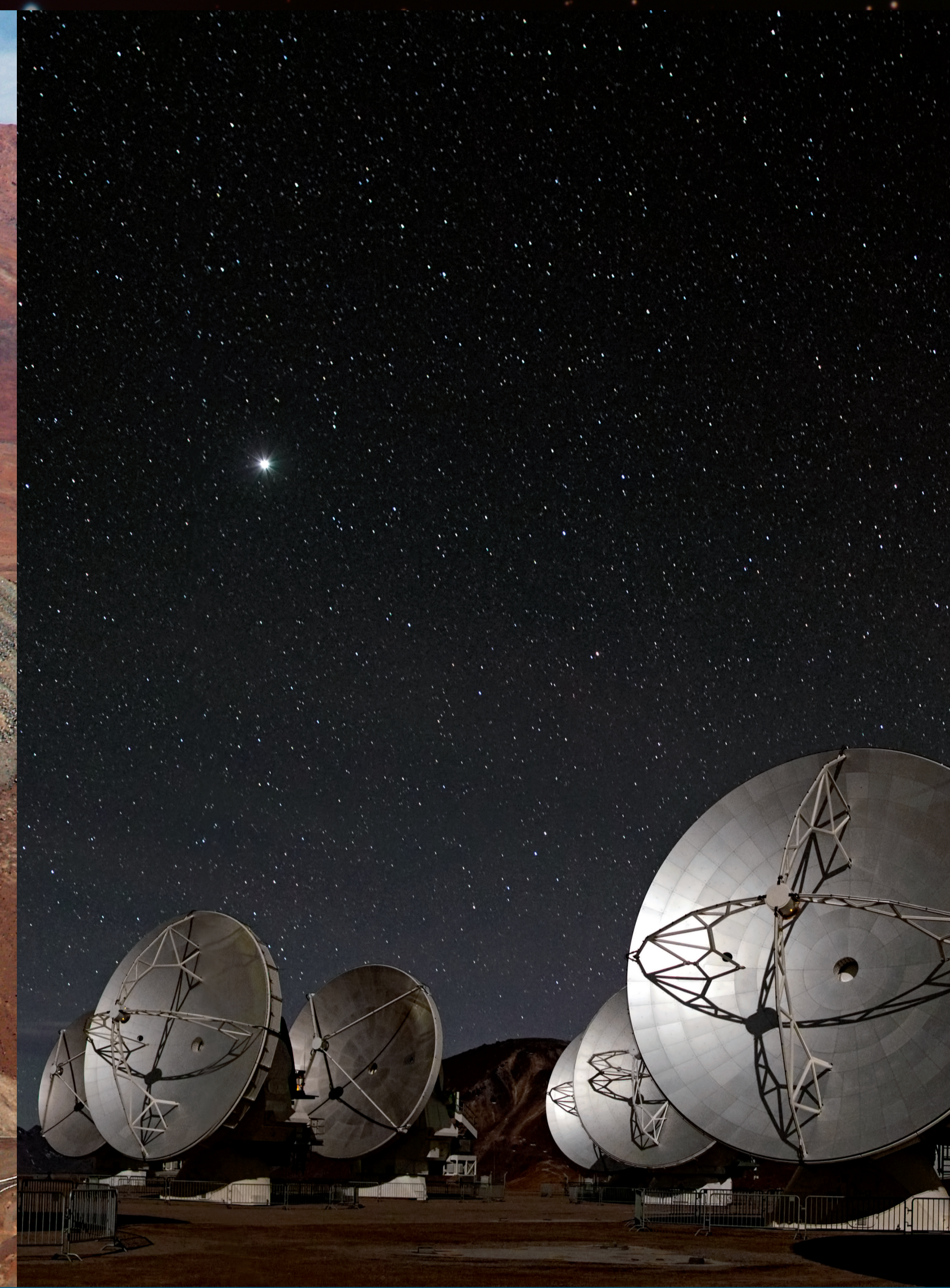
The Atacama Large Millimeter/submillimeter Array (ALMA).