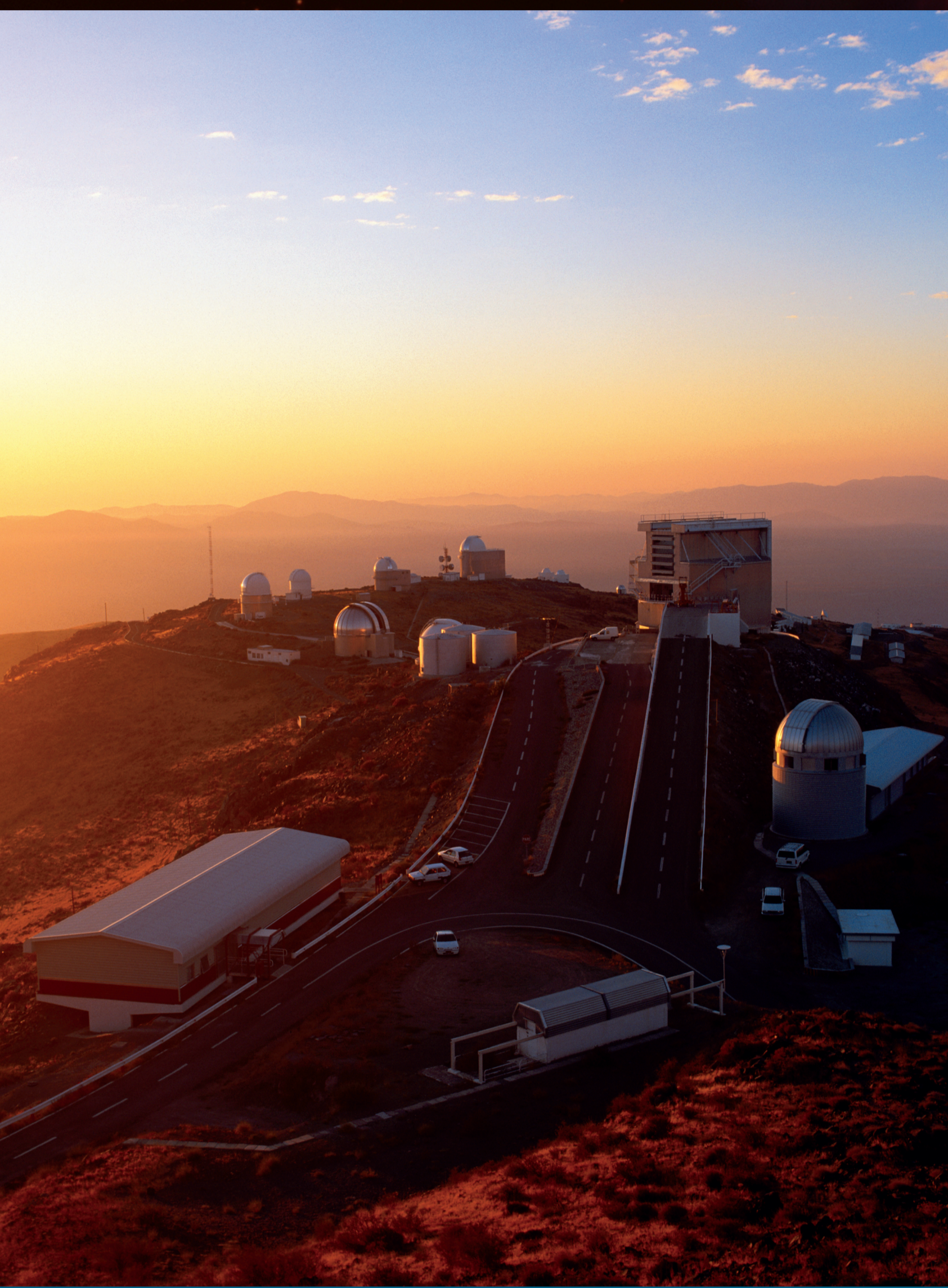
The La Silla Observatory.

A Studentship programme for PhD students lasting one to two years is also available.