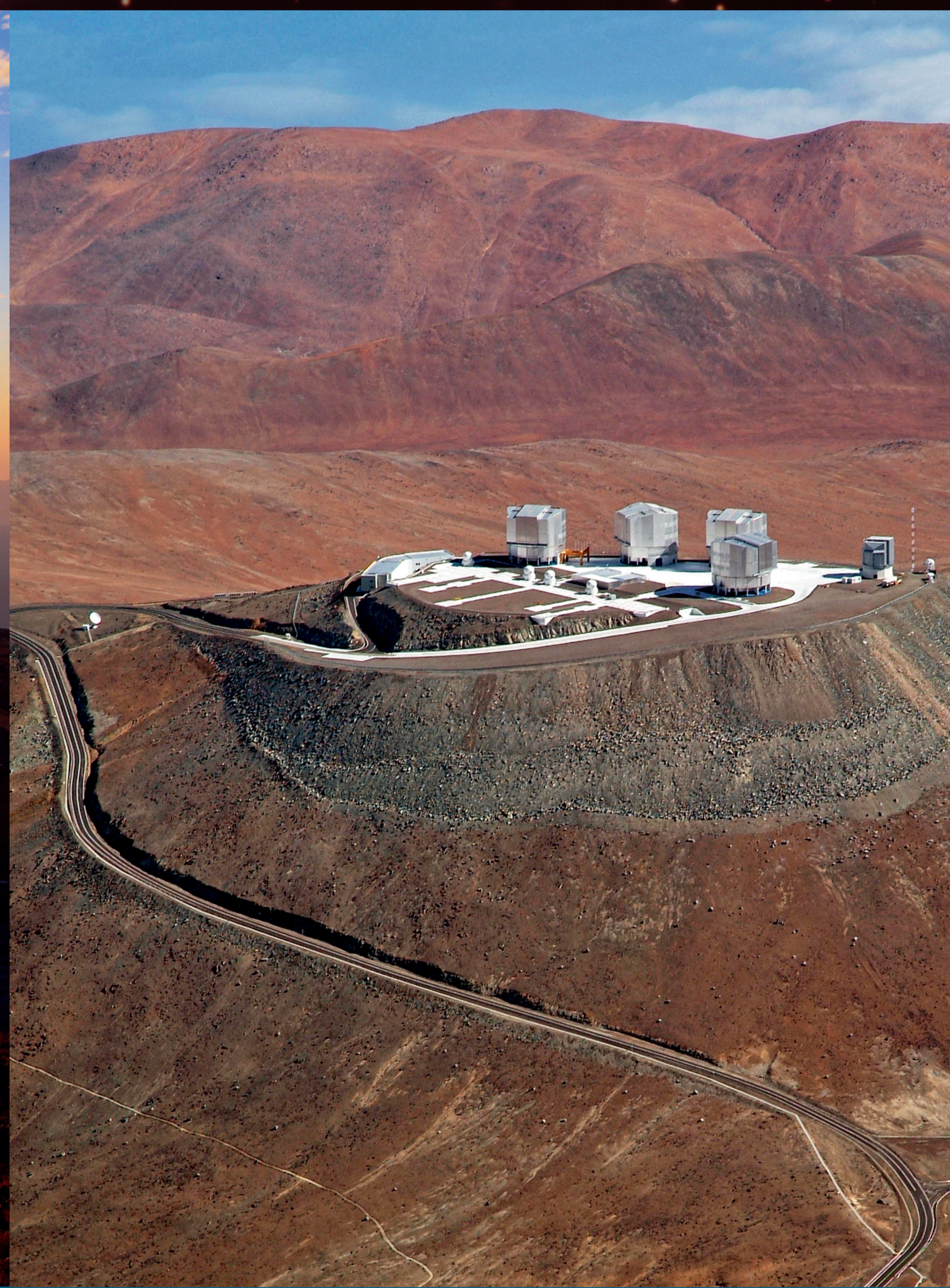
Aerial view of the ESO Very Large Telescope (VLT) platform.