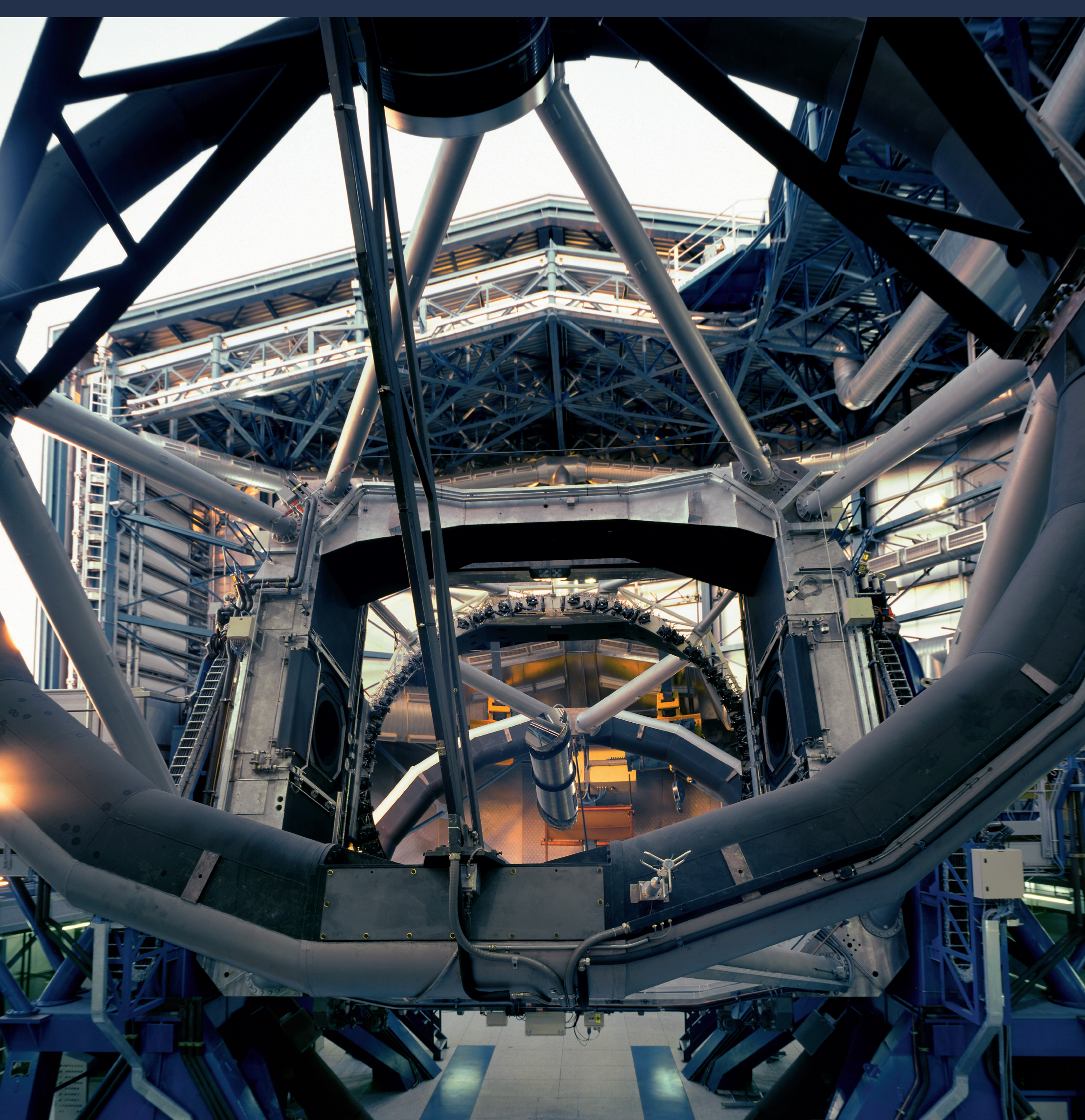
The VLT Unit Telescope 2, Kueyen (The Moon).

The VLT is the most productive individual ground-based astronomical facility, and results have led to the publication of, on average, more than one peer-reviewed scientific paper per day. The VLT has stimulated a new age of discovery, with several notable scientific firsts, including the first image of an exoplanet, the tracking of stars moving around the supermassive black hole at the centre of the Milky Way and observations of the afterglow of the furthest known gamma-ray burst.