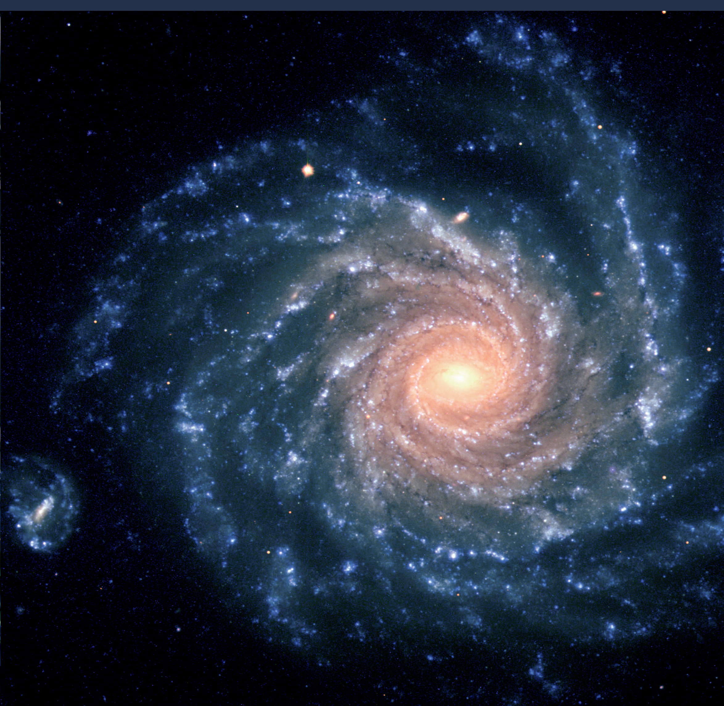
Spiral galaxy NGC 1232, as seen by the VLT.