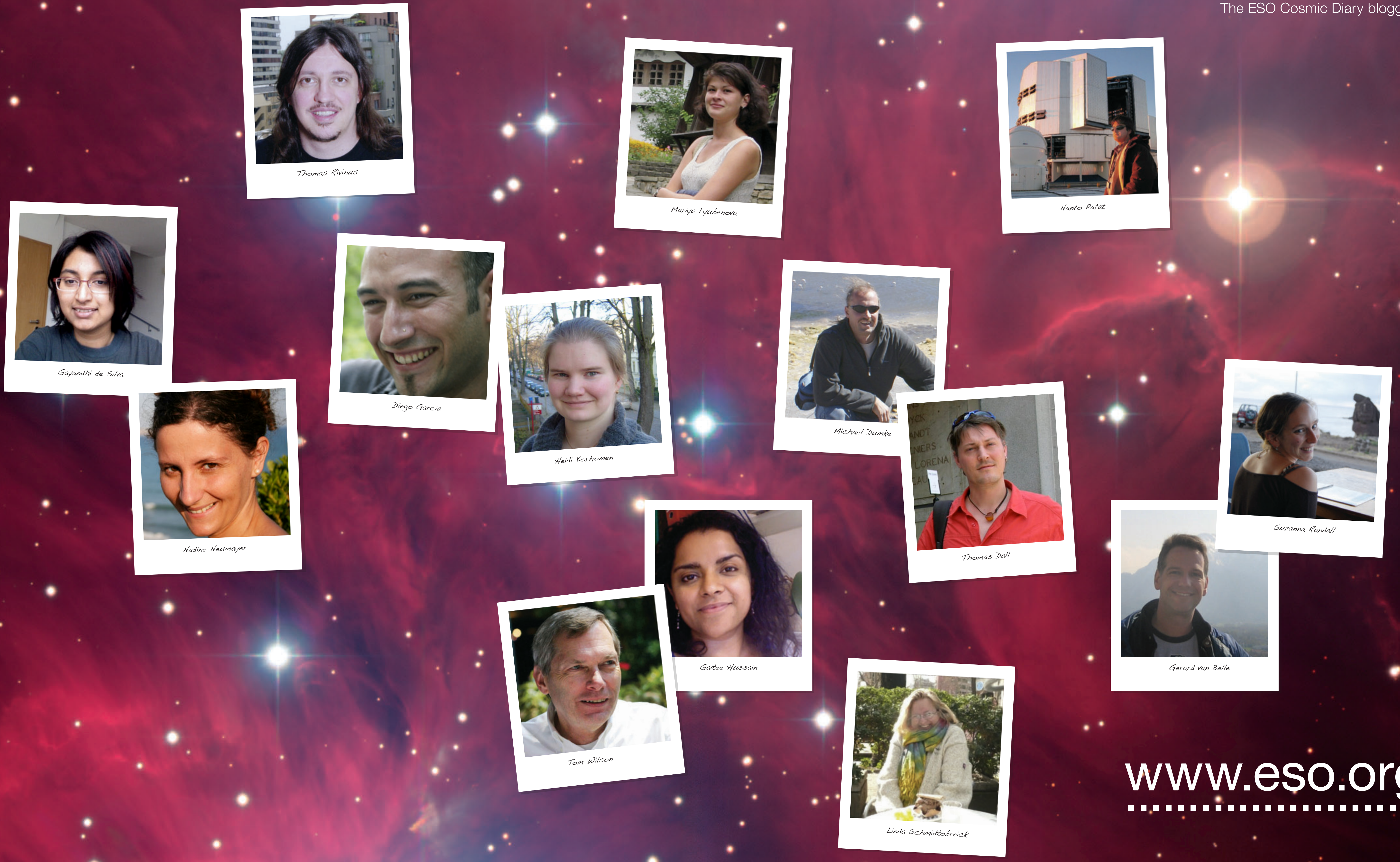
The ESO Cosmic Diary bloggers